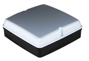
Black | Opal