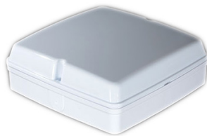
White | Opal