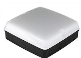
Black | Lumaax™