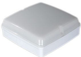
White | Lumaax™

The Isis/ Lumaax, when using a 500 mA Tridonic Driver and Led Board, achieves 1255 lm . Photometry results and LDT files are available upon request.