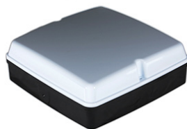
Black | Opal