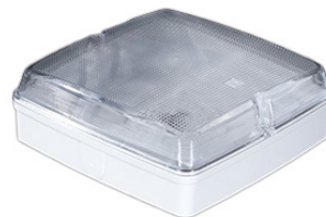
White | Clear